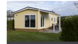
Prisma Chalet 6p