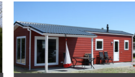
Prisma Chalet 4p