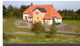
Wellness 12 pers.