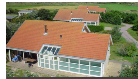
Villa 8 pers.