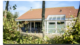
Villa 12 pers.