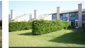
Schakel 6 pers.