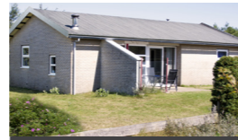
Riant 4 pers.