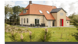
Wellness 10 pers.