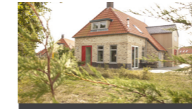
Wellness 4 pers.