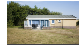
De Bungalow 6 p.