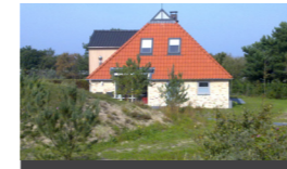
Wellness 8 pers.